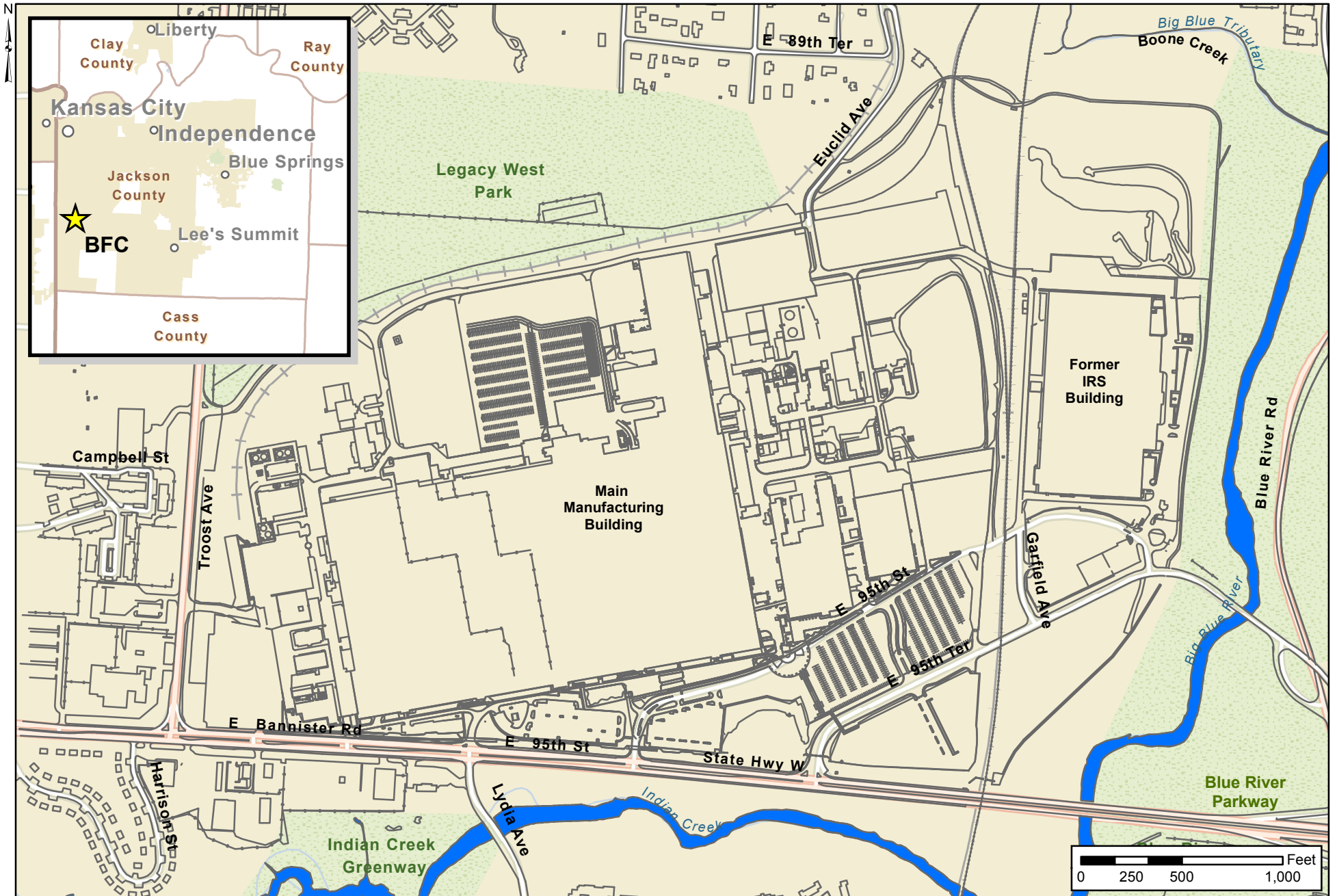
Figure 1 Location map of the Bannister Federal Complex (BFC)